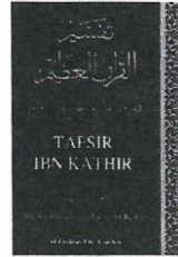
Tafsir Ibn Kathir Volume 2