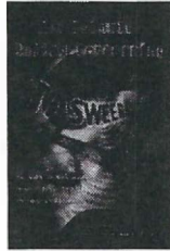
The Islamic Ruling Concerning Tasweer