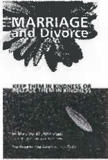
Marriage & Divorce