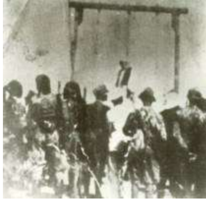
September 16, 1931. His hanging in Saluq.

Omar AlMukhtar was attached to Allah, depending on Him, and accepting that which Allah had written for him. He asked Allah to become a martyr and this what he has attained, inshAllah.