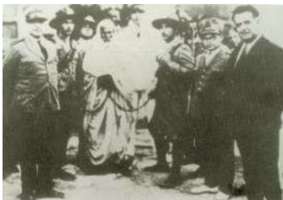
In shackles, after his capture and brought to Saluq.

When the Italian general made him a final offer to make him their puppet and be allowed to live like the other leaders of his people, he answered, "I shall not cease to fight against thee and thy people until either you leave my country or I leave my life. And I swear by Him who knows what is in men's hearts that if my hands were not bound this very moment, I would fight you with my bare hands, old and broken as I am.."