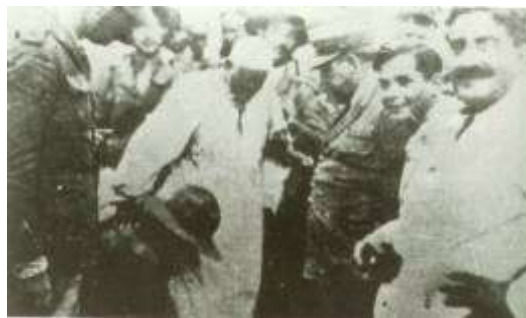
Captured in his 70's.

This man believed Jihad was ordained upon every able Muslim while his homeland was occupied by the colonizers. With his faith, heroism and courage he earned the respect of even his enemies.