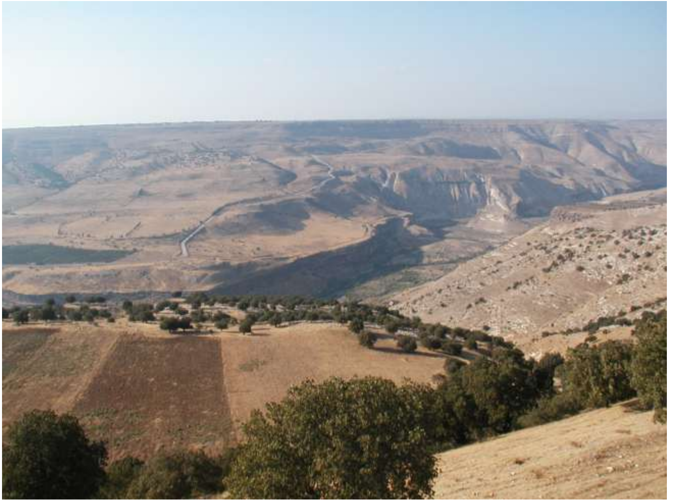
Here are some more of the Valley of Yarmouk: