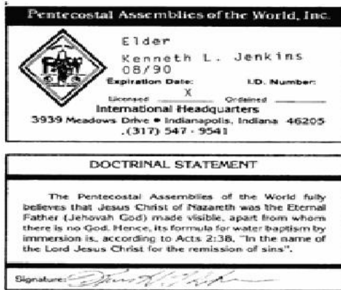
ID card of a priest